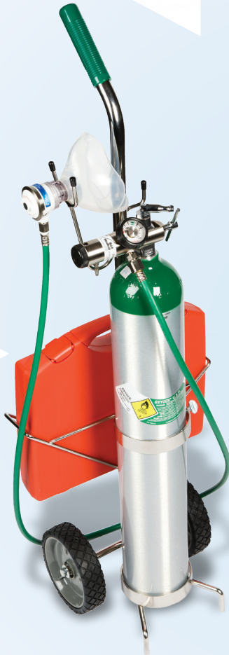
SM-Series kit with optional O2 cylinder

*Morton Rosenberg, DMD, "Preparing for medical emergencies, The essential drugs and equipment for the dental office," The Journal of the American Dental Association, JADA (May 2010 – Volume 141)