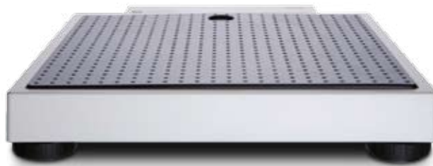
The fit at design and slip-proof surface ensure easy access and a secure stance.