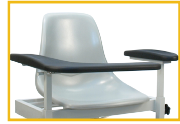
W/ Fiberglass seat also available MODEL # 2587

Electrical components are UL approved for medical use