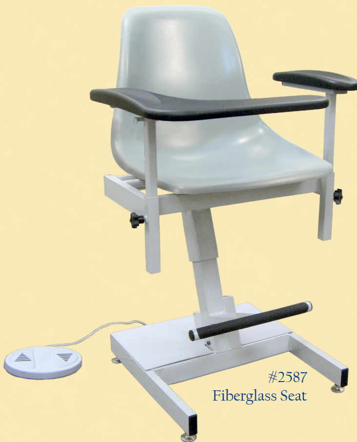
#2587 Fiberglass Seat

Patented blood drawing chair raises and lowers in seconds with portable foot switch. Lower the seat down for safe patient entry and exit; raise the seat up to reduce back strain on the phlebotomist. Electrical components are UL approved for medical use.