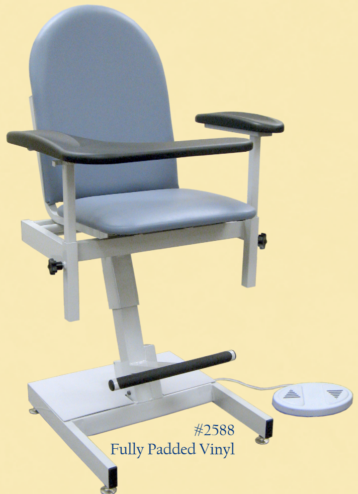
#2588 Fully Padded Vinyl