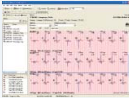
Stage by stage summary of averages for each lead.