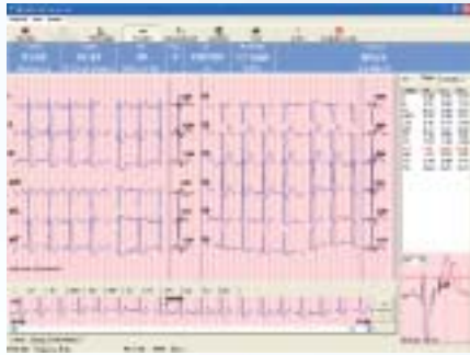
Continuously updated ST table highlighting lead with greatest ST.