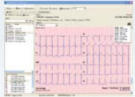
Program your own views for reviewing the test after completion.