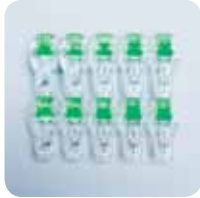
Clear ECG Clips (4mm & Snap)