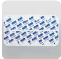
Disposable EZ-Trode ECG Electrodes