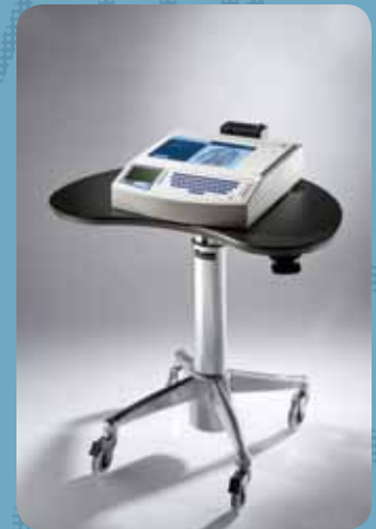
Portable with an integrated printer, the IQclassic™ can be used in any exam room