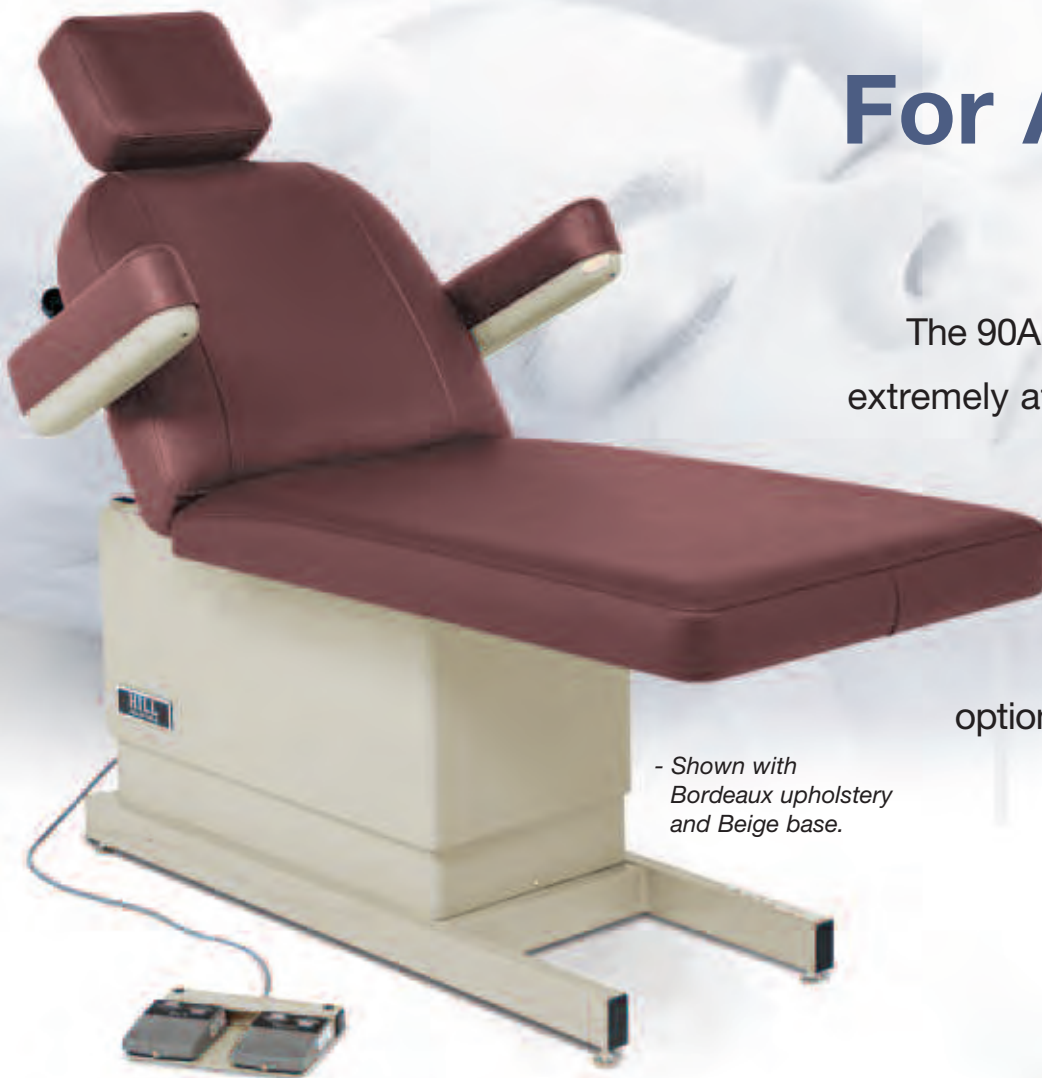
- Shown with Bordeaux upholstery and Beige base.

The 90ALB (Aesthetic Lift Back) is an extremely affordable chair for skin care with 2" of soft foam over 1 1/2" of medium-density for maximum patient comfort. Many standard and optional features make the 90ALB ideal for aesthetic work.