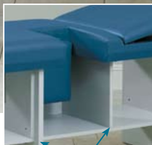
Double Window Drop Supports