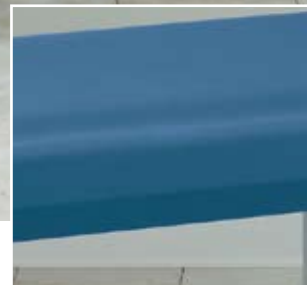
Top and Contoured Frame Upholstered Together