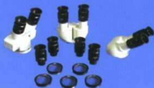
Tilttable & inclined & straight binocular Objective & Eyepiece