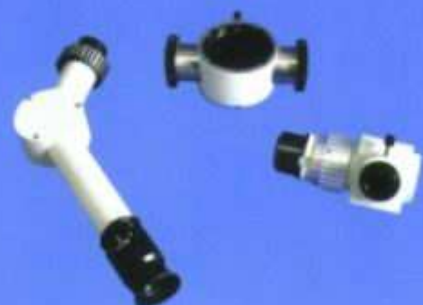
Observer's monocular Beam splitter & CCD Adaptor