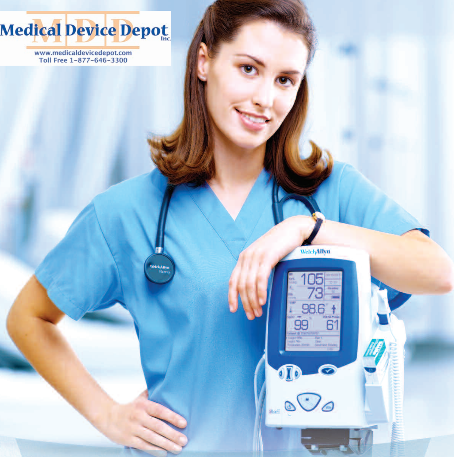
The Welch Allyn Spot Vital Signs® LXi