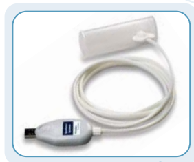
Welch Allyn SpiroPerfect™ PC-Based Spirometer