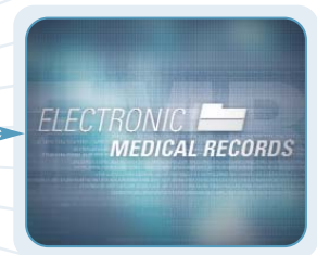
Transfers Test Data to Electronic Medical Records Systems

Medical Device Depot Inc. www.medicaldevicedepot.com 1-877-646-3300