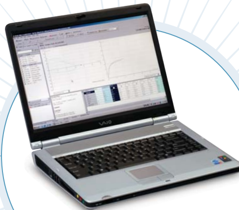
Welch Allyn CardioPerfect™ Workstation Software