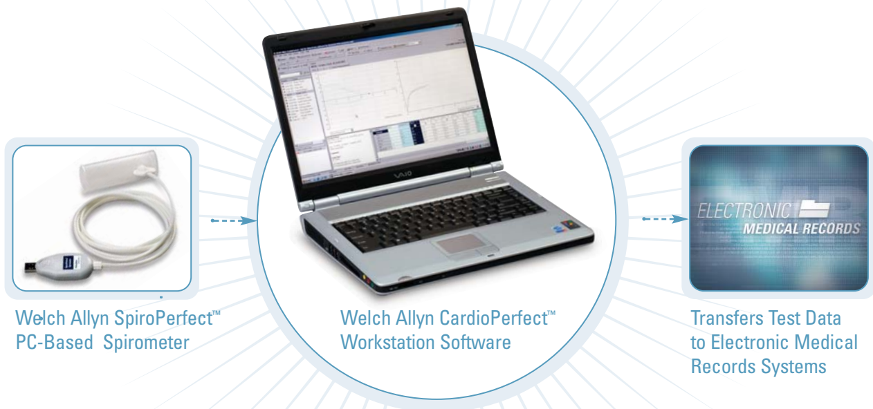
Welch Allyn SpiroPerfect™ PC-Based Spirometer