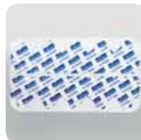
Disposable EZ-Trode ECG Electrodes