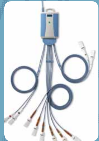
Lightweight, portable design, weighing less than 11 oz.