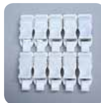
Universal ECG Clips (3mm, 4mm, & Snap)