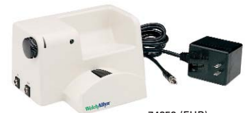
74352 (EUR) 74354 (UK)