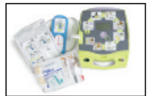
CPR-D•padz come complete with rescue essentials including a barrier mask, a razor, scissors, disposable gloves, and a towelette.