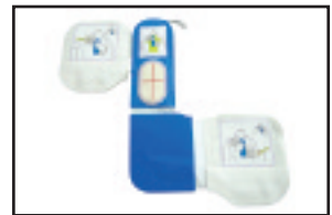
CPR-D•padz offer clear anatomical placement illustrations and a CPR hand positioning landmark.