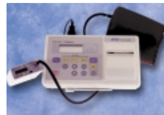
TM-2480 Printer with TM-2430 ABPM

The TM-2430 ABPM is a portable and lightweight unit with a carrying case that can attach to a belt